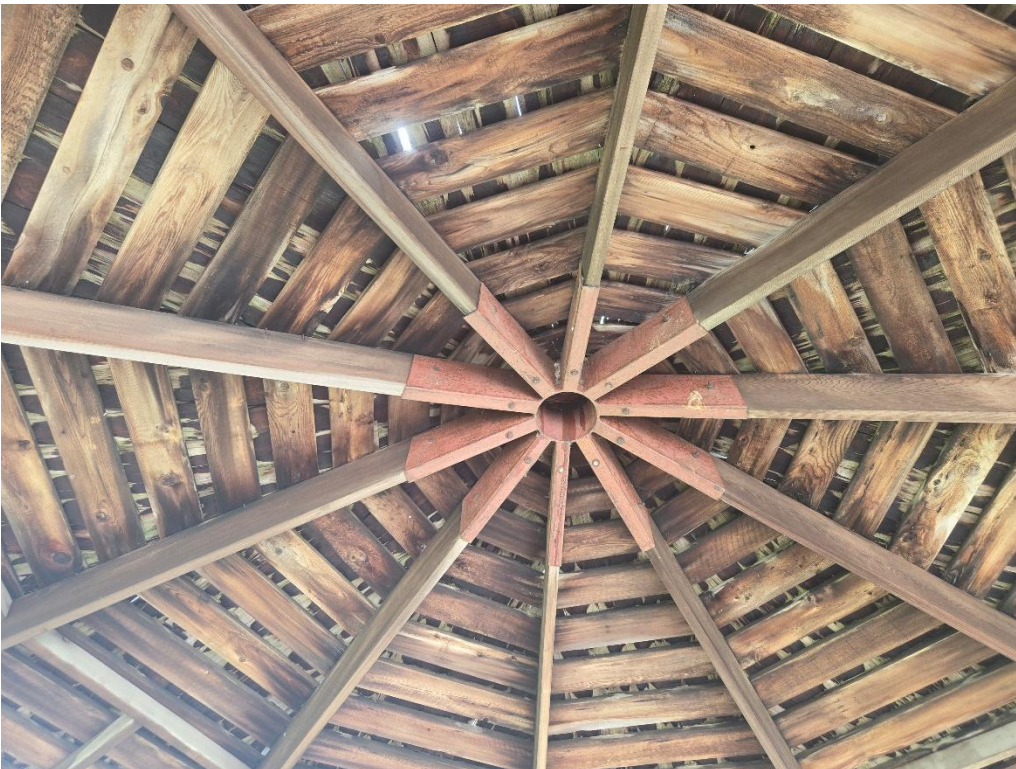
Figure 5 Roof does not currently have any decking; wood shakes are installed. Decorative “copper” metal caps cover the edges where they meet.