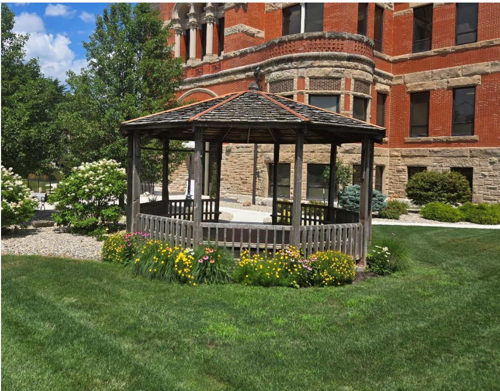
Figure 1 Gazebo, Noble County Courthouse Square – Albion, Indiana.