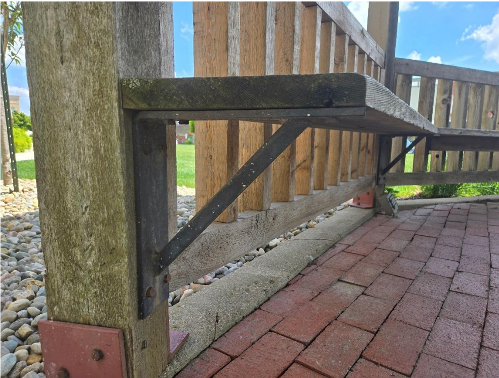
Figure 4 Seating supports; seats are narrow in depth and wider bench seats would be preferred.