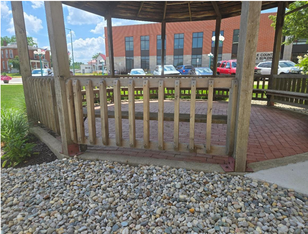
Figure 2 Footer under each wall section measures 6' wide; 10 sections (including opening shown.)