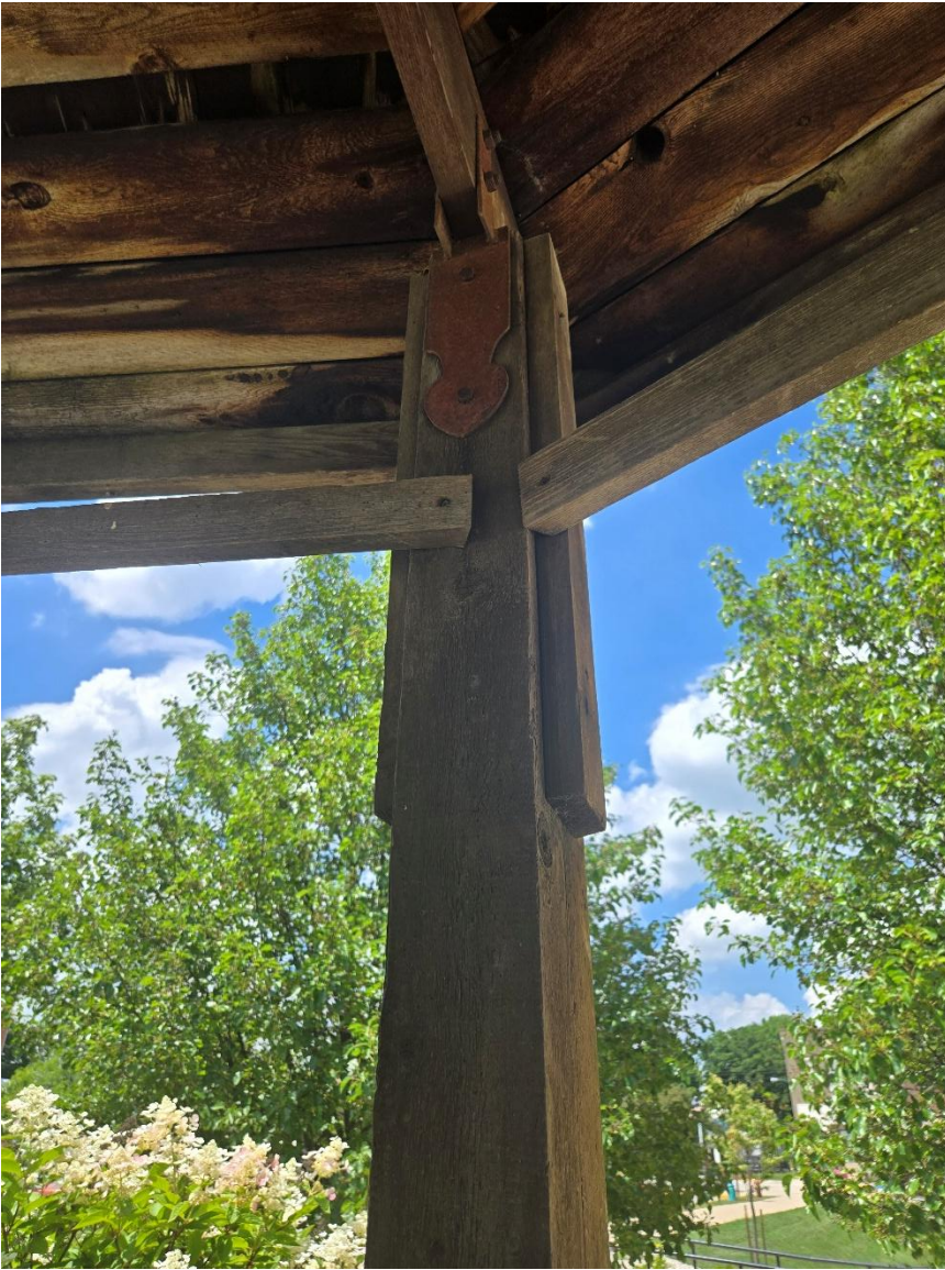
Figure 6 "Leftover" various wood pieces and hardware (screws, etc.) need to be removed, as seen in photo. These were previously used to hold lattice panels. Alternative, decorative options will be considered if proposed.