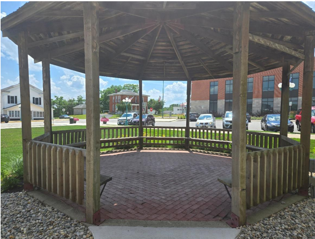
Figure 3 Floor repairs are not included in scope of project.